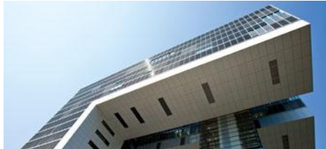
WE REALIZE YOUR VISIONS! TROX IN OPERATION