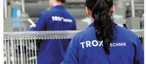
QUALITY BY TROX QUALITY STANDARDS