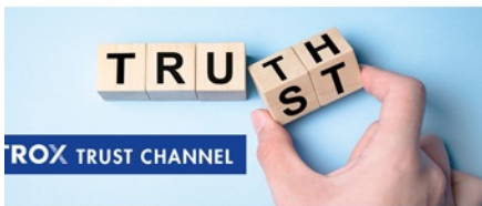
TROX WHISTLEBLOWER SYSTEM TROX TRUST CHANNEL