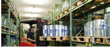
PROCUREMENT AND PURCHASING STRATEGY PROCUREMENT