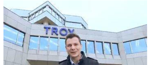
TOUR DE COMPETENCE FASCINATION WITH TECHNOLOGY